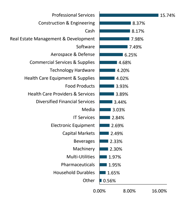
*Sector Allocation as of 28/04/2024